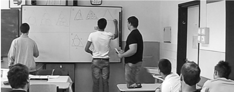
Figure. Students drawing their arrangements on the board.

Although the students came up with various ideas, due to a lack of time we settled on one that suggested replacing the square with an equilateral triangle and trying to arrange congruent circles inside it. At first, the students only had to work out the possible arrangements, as, in my experience, it often helps if they receive a task in easily understandable chunks.